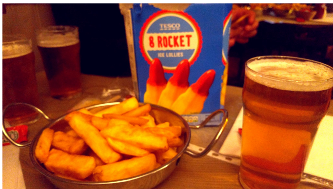
Chips n lollies