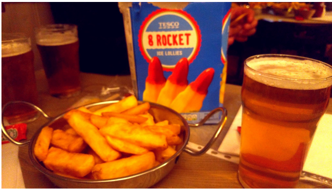
Chips n lollies