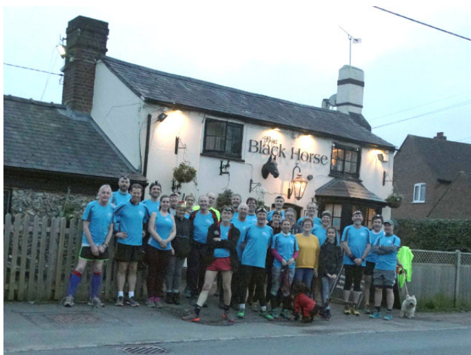
It's the Pub of the Year!