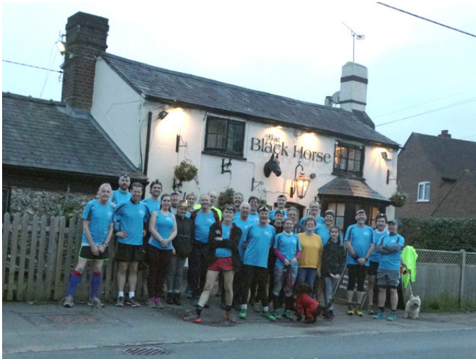
It's the Pub of the Year!